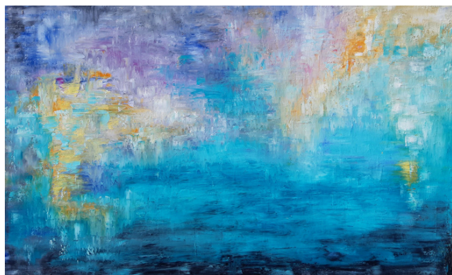
Ocean abstract paintings by our Founder, donating 20% of sales to marine conservation

Building Bridges 2025 did not disappoint! We were there to reconnect with partners for impact investing & sustainable oceans.